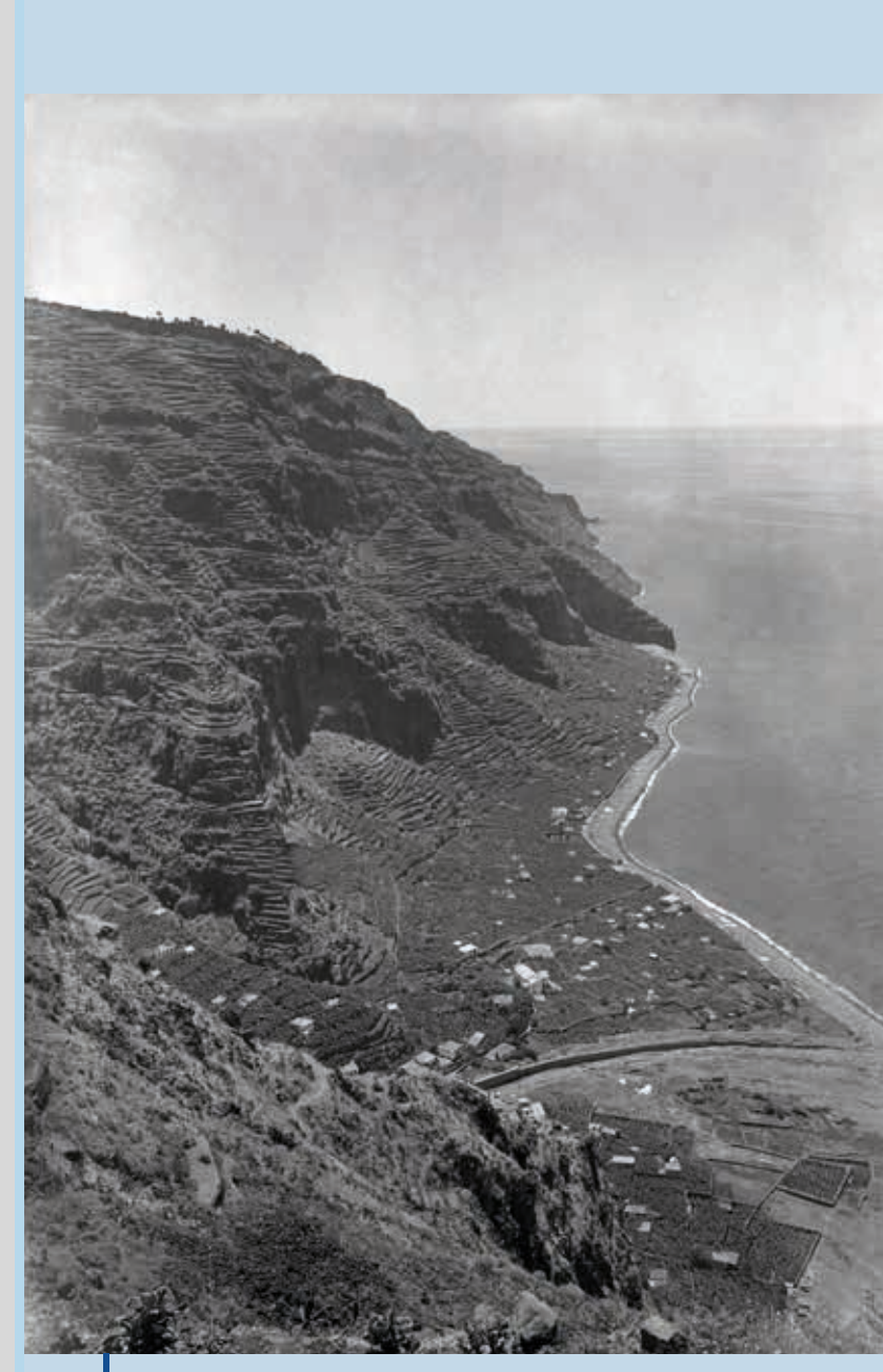
Panoramic view of Madalena do Mar parish. Photo by Figueiras, after 1930, glass plate negative, MFM-AV, in deposit at ABM, PHF/63.

The disclosed images - photographs and two postcards belong to the Photographic Collection and the Illustrated Postcard Collection of the Madeira Archives and Library, and to the collection of the Museu de Fotografia da Madeira - Atelier Vicente's, in deposit at the same institution. They date back to a period of about a century from the second half of the 1800s to the year 1975. Parish by parish, they show: panoramic views; coastal and rural landscapes, urban centers views; churches and chapels; the pier of Ponta do Sol (an emblematic construction, from the mid-19th century); beaches and vessels; tunnels, roads, streets, automobiles, bullock carts; manor houses, thatched houses, huts, mills and other buildings; ruins; chimneys and bell towers; manifestations of popular culture - traditional festivities, sheep shearing. At the end, we have visual records of the visit of the Image of Nossa Senhora de Fátima in 1948, a relevant event in the religious and social sphere.