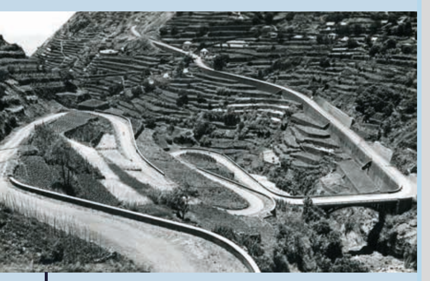
Regional road between Canhas parish and Arco da Calheta parish, across the stream of Madalena. Photo by Perestrellos, before 1940, photographic print, ABM, ENP, folder 24, no. 123.