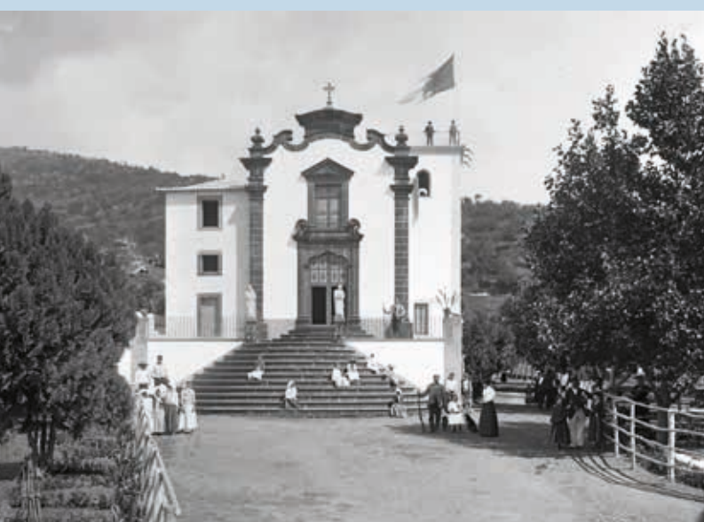
Main facade of the chapel of Espírito Santo; one can see several people by the staircase and, in the tower, a royal flag and two men. Photo by Joaquim Augusto de Sousa, before 1905, glass plate negative, MFM-AV, in deposit at ABM, JAS/177.

Pier of Ponta do Sol village; one can see the path connecting to the village and, on the beach, a sailing vessel and several canoes. Photo by Perestrellos, unknown date, glass plate negative, MFM-AV, in deposit at ABM, PER/127.