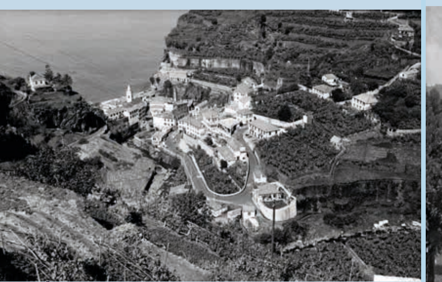
View of Ponta do Sol village. Photo by Vicentes, before 1964, film, MFM-AV, in deposit at ABM, VIC/777.