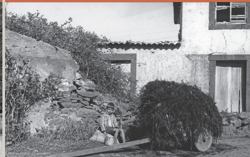
Typical two-wheeled cart loaded with manure, Maloeira, Fajã da Ovelha. Photo by Rosado, 1971, negative film, ABM, COLFOT, n4353.

In addition to images from the Regional Archives of Madeira Photographic Collection, several photographs taken by various photographers belonging to the "Photographia Museum Vicentes" Collection are also displayed.