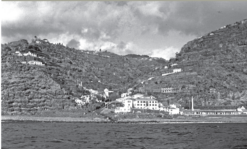
The town of Calheta seen from the sea. Photo by Perestrelos, second quarter of the 20th century, negative film, ABM, PER/3281.