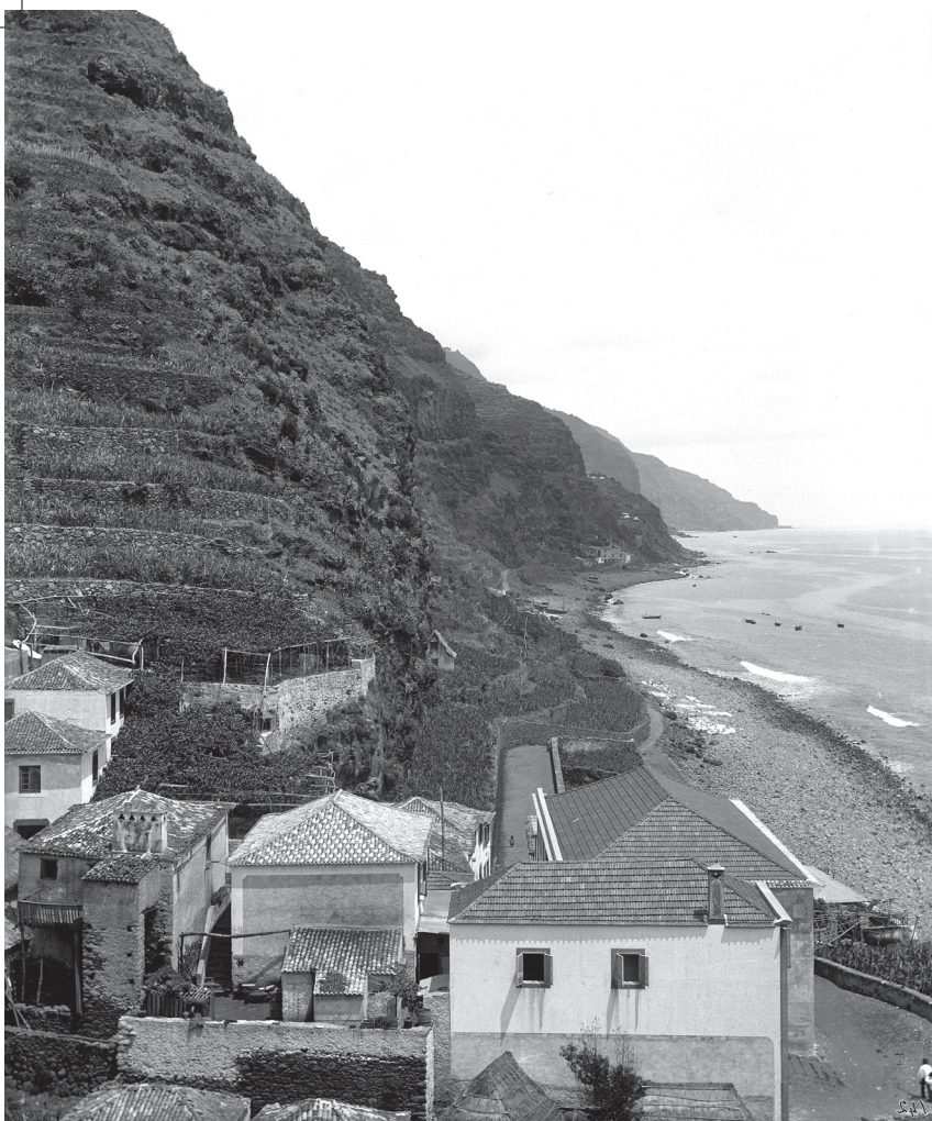
View of the pebble beach of Calheta seen from the West; in the foreground, the town houses. Photo by Joaquim Augusto de Sousa, late 19th century, glass negative, ABM, JAS/801.