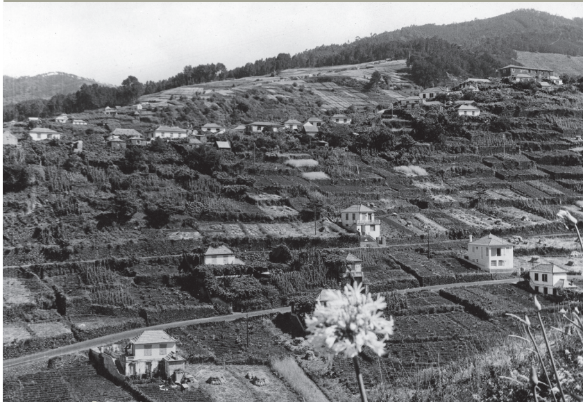
View of the Lombo do Doutor (Doctor's Hill), Calheta, showing buildings erected on the ridge.