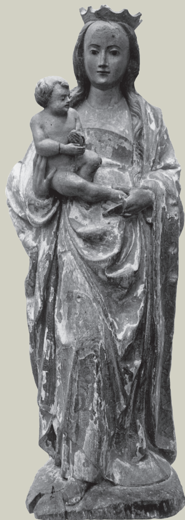
Nossa Senhora da Estrela (Our Lady of the Star): sculpted polychromed and gilded figure, Flemish School, early 16th century: this work of art belonged to the lost chapel of the same invocation and was found in the small oratory of "Casa da Pimentinha". Photo Rosado, 1970, negative film, ABM, COLFOT, n3797.