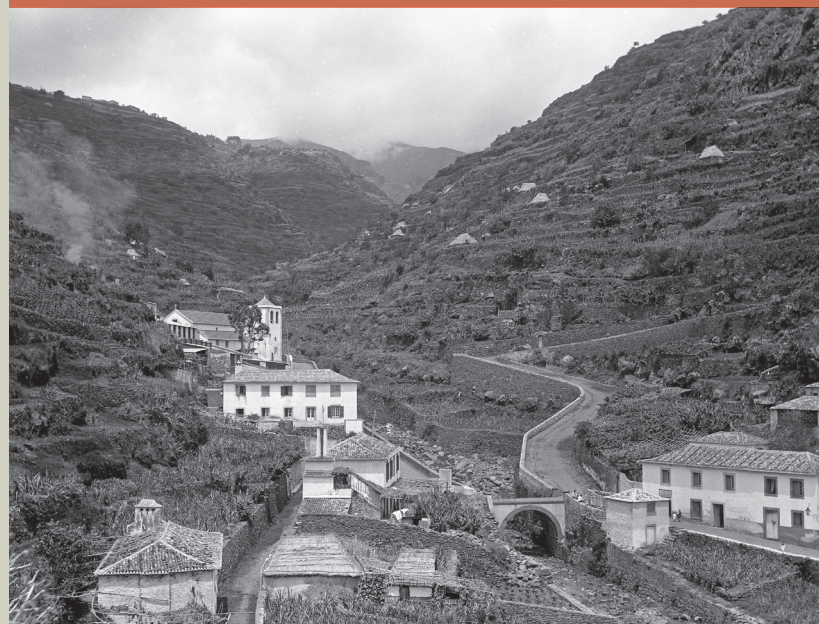
Panoramic view of the town of Calheta seen from the South; on the left, the Church of the Holy Spirit. Photo by Joaquim Augusto de Sousa, early 20th century, glass negative, ABM, JAS/802.

In this exhibition, the Regional Archives of Madeira (ABM) presents old memories of the Costa de Baixo (Lower Coastal) region of the island, captured for all time through photographic images and documents of different kinds.