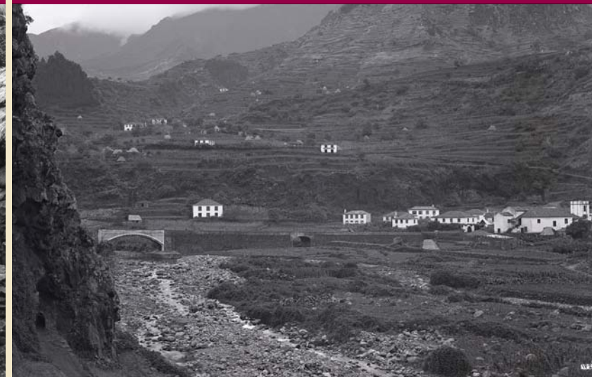
São Vicente viewed from the north.