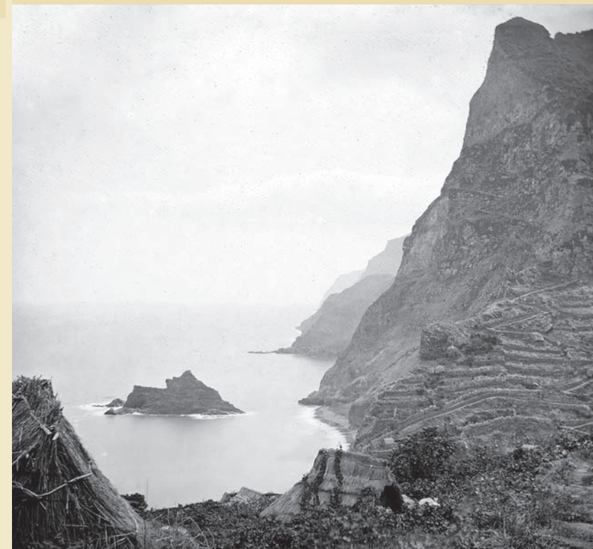
The rugged coastline of Boaventura viewed from the west, showing the so-called «Entrosa», a steep zigzagging road to Arco de São Jorge, and Ilhéu Preto (the Black Islet) near the mouth of Ribeira do Porco. Photo by Vicentes, late 19th century, glass negative, ABM, VIC/132.

Important features of urban settlements in the past and of the built heritage of all three parishes of the municipality are also shown. The exhibit includes pictures of the festival of Senhor Bom Jesus (Good Lord Jesus) of Ponta Delgada, a tradition dating back to the 16th century, as well as of centuries old specimens of rural architecture in Ribeira Grande, São Vicente and Lombo do Urzal (Heath Knoll), on the outskirts of Boaventura. Pictures of particular interest show the ruins of an 19th century rum factory that used to stand at the river mouth of Ribeira do Porco, a relic of industrial archaeology which no longer exists.