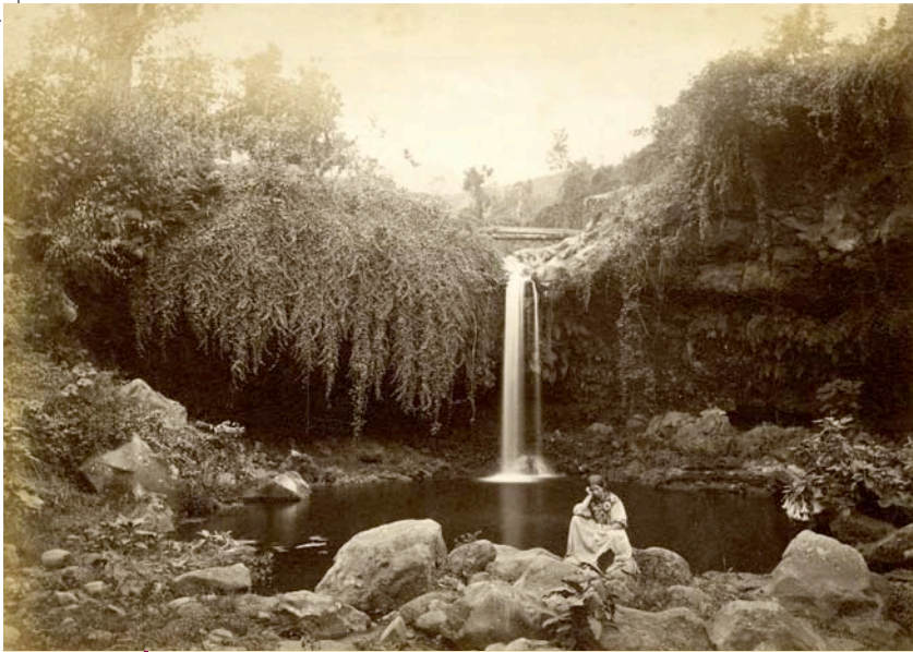
Idyllic waterfall scenery in Rosário, São Vicente.