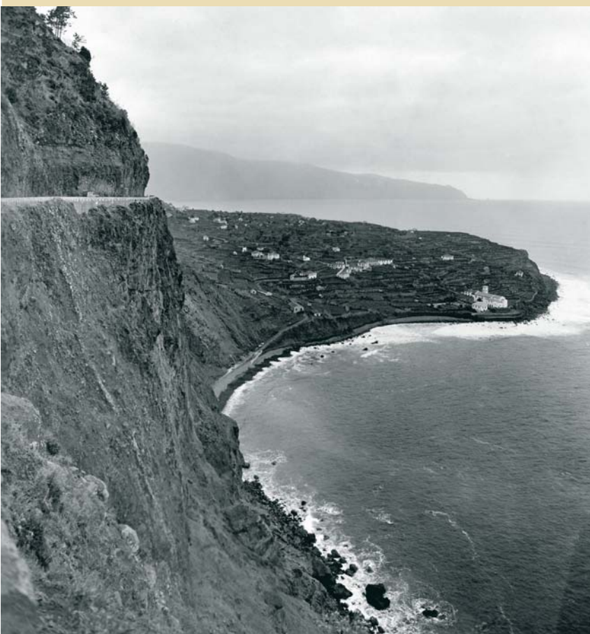
Ponta Delgada viewed from the east, showing the new road boldly cutting through the steep cliff. Photo by Perestrelos, late 1940s or early 1950s, photographic print, ABM, ENP, Pt. 22, n.º 156.

In this exhibition, the Regional Archives of Madeira (ABM) presents old pictures of this municipality located on the northern coast of Madeira.