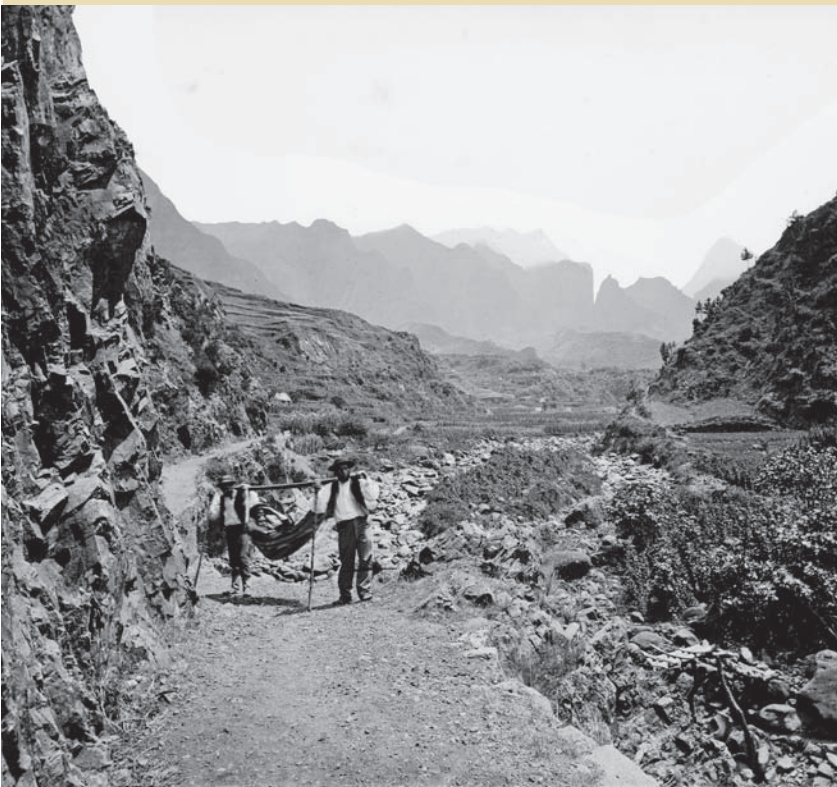
Descending alongside the riverbed in a hammock, São Vicente. Photo by Vicentes, 1880s, glass negative, ABM, VIC/481.