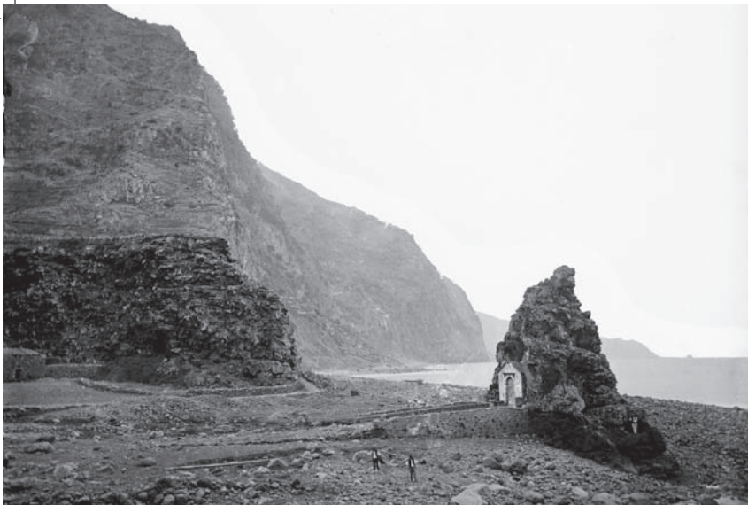
View of the mouth of the River of São Vicente, showing the extraordinary rock where a small chapel was built. Photo by Vicentes, 1870s or 1880s, glass negative, ABM, VIC/482.