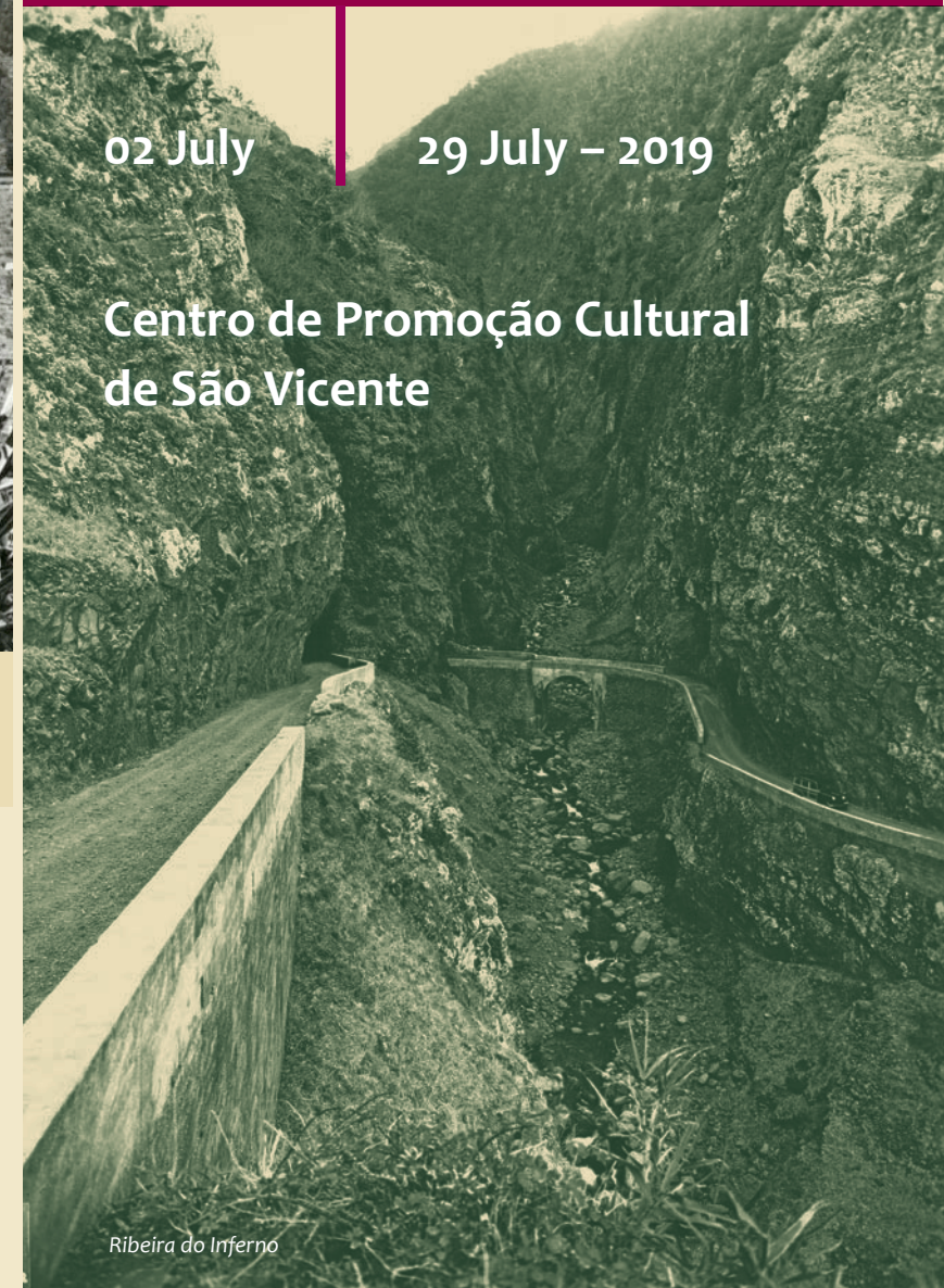
Ribeira do Inferno

Centro de Promoção Cultural de São Vicente