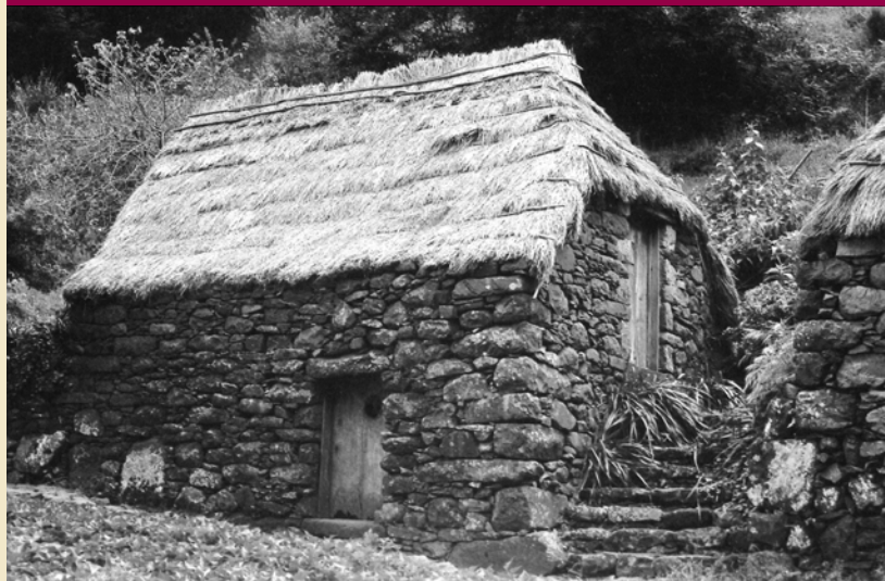
Old stone thatch-roofed construction on the outskirts of Boaventura, Lombo do Urzal. Photo by Jorge Valdemar Guerra, 1977, author's collection.